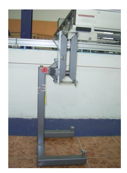
Figure 7. Stand for static calibration of the resistance dynamometer

The experimental equipment for resistance tests allows the measurement of the trim and sinkage of the model at given speed, in still water, as well as the heave (max. 0.3 m.) and pitch (max. 21deg.) motion amplitudes in incident waves.