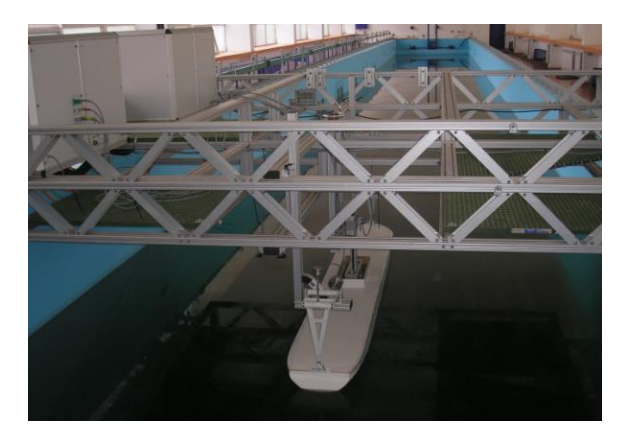
Figure 1. Towing tank of the Naval Architecture Faculty

A hydraulic wave generator system is used to induce regular waves (Figure 4) with the circular frequency of 0.4-0.9 Hz.