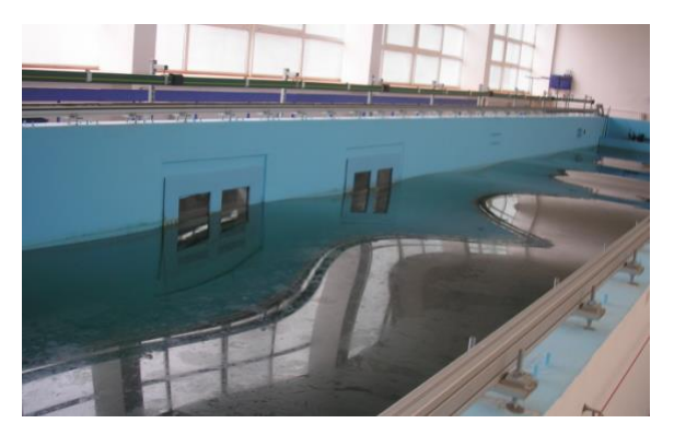
Figure 4. Hydraulic waves generation