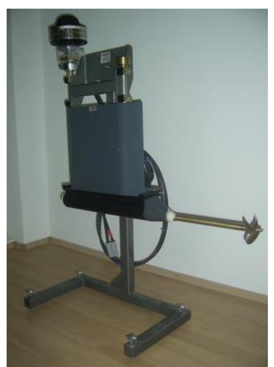
Figure 10. Open water propeller dynamometer

The experimental equipment for open water propeller tests (Figure 10) includes the H75e open water propeller dynamometer, which will be rated for thrust measurements up to 250 N, and torque measurements up to 10 Nm at 2010 rpm.