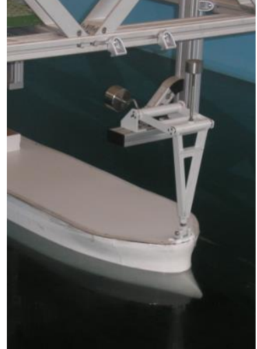
Figure 6. Guidance system for the movement of the experimental model