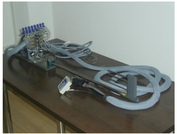
Figure 11. Wake rake with four Pitot static tubes

The experimental equipment includes a carriage mounted R23e wave probe (Figure 12) for measuring the waves generated in the towing tank, with the maximum height of 0.25 m.