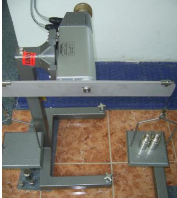
Figure 8. Components of the experimental equipment for self-propulsion tests