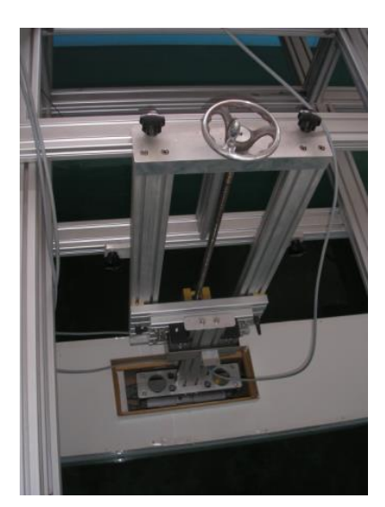
Figure 5. Resistance dynamometer and coupling arm to the towing carriage