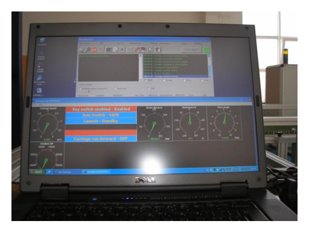
Figure 3. Data acquisition system